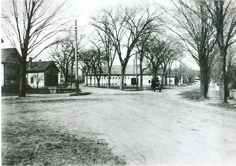
Undated view of 159 Ash St. (2 nd from left) and Nokes Stable and Blacksmith Shop (at center)