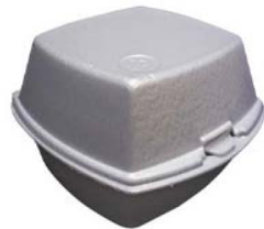
Takeout Containers No Food Particles!

Must have #6 recycling symbol on it and rinsed