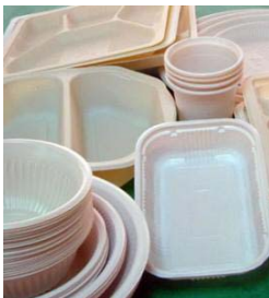
Meat and produce trays

The Town of Reading is pleased to announce our permanent Styrofoam Collection drop-off location. The Town has partnered with ReFoamIt of Framingham to offer this drop-off location. This is part of the Town’s continuing effort to expand its recycling program and reduce the amount of trash we send to the incinerator.