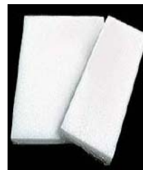
White Insulation Board